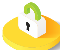
LifeLock™ Identity Theft Discounts