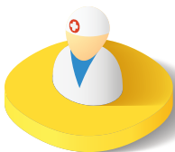
Healthcare2U DPC Value