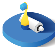
SML Dental Discounts