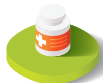
Paramount RX® Discounts